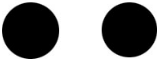
U.S. Quarter (24.26mm)

For comparison, a U.S. Quarter is 24.26mm in diameter (across); a quarter is nearly the same size as a 25mm round cabochon.